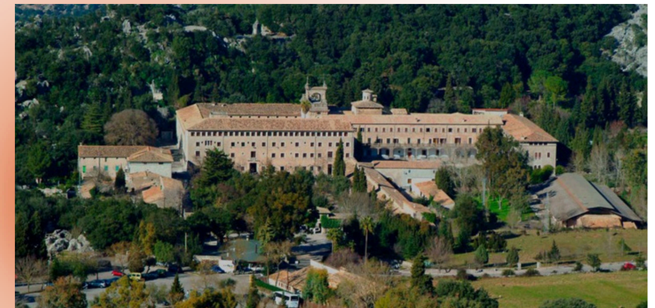
some of our previous locations

Each programme is tailored to your specific needs. The investment will depend on the number of people you want to bring and the location we choose together.